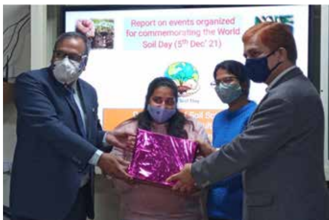
Prize distribution to the winners of the Poster Making Competition held on the occasion of World Soil Day dated 5th Dec. 2021