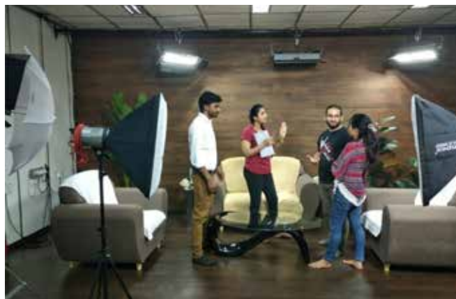
PG students planning for recording in Video lab