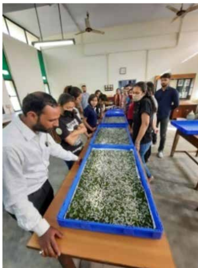
B.Sc. Ag. Final year students doing sericultural activities under ELP course APE 461 Sericulture