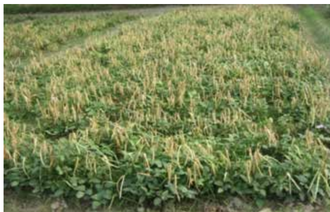
Pant Grain Cowpea-7