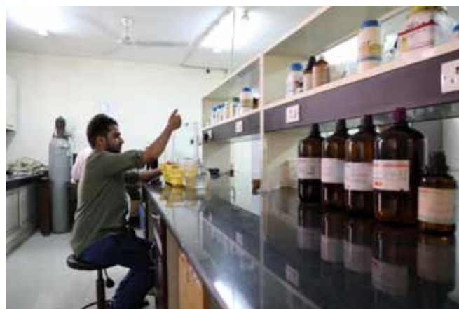
Students working in Wet Analysis Laboratory in the Department of Soil Science