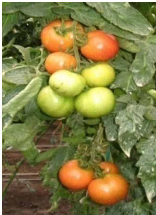
Pant Polyhouse Tomato-2