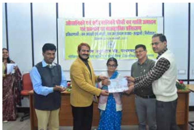
Certificate distribution in Training on Nursery Production held from 22-02-2021 to 26-02-2021 at HRC, Patharchatta