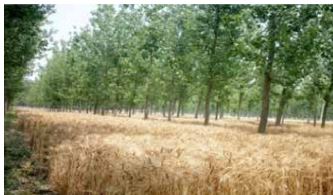
Poplar Hybrid - 5