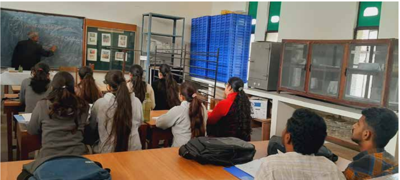
PG class in Sericulture laboratory