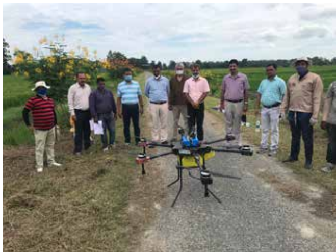
Agriculture Drone launched on 12 th October 2021 under Agri-Informatics group, IDP, NAHEP