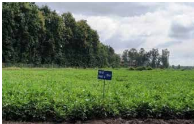
Pant Urd - 12