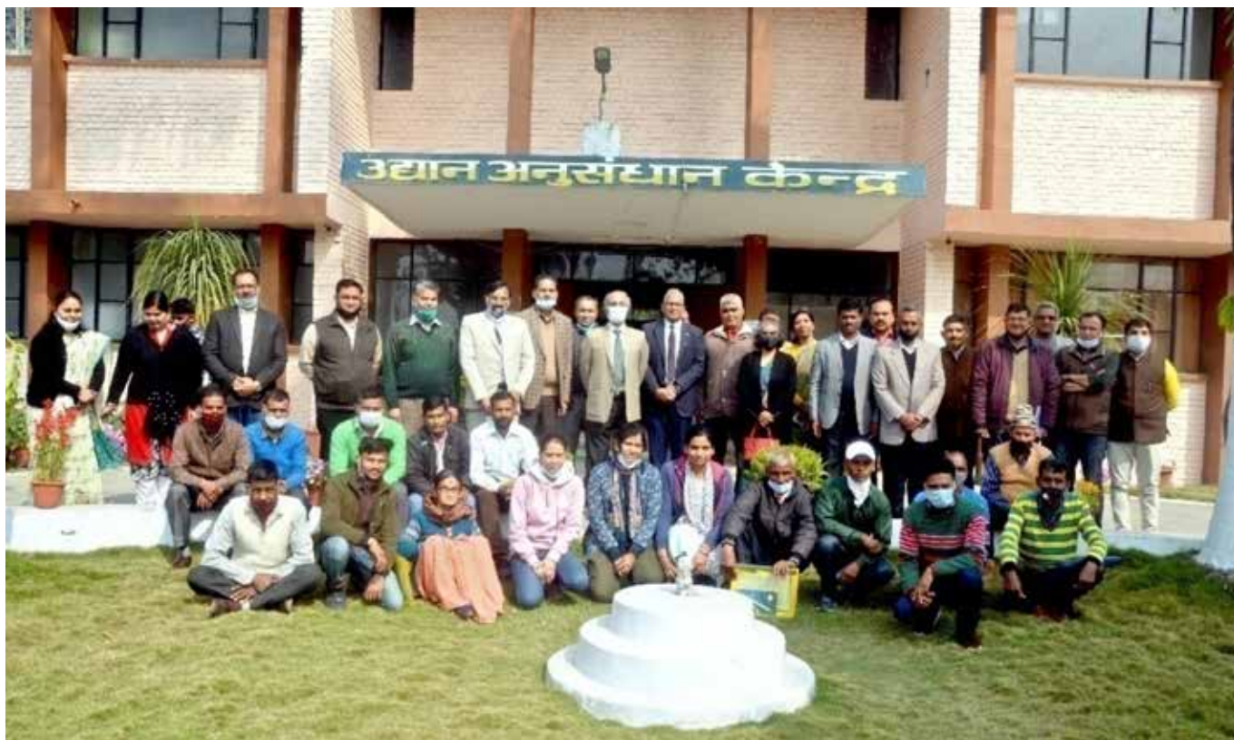
Five days training programme on “Propagation and Nursery Production of Horticultural and Forestry Plants” held from 22-02-2021 to 26-02-2021 at HRC, Patharchatta