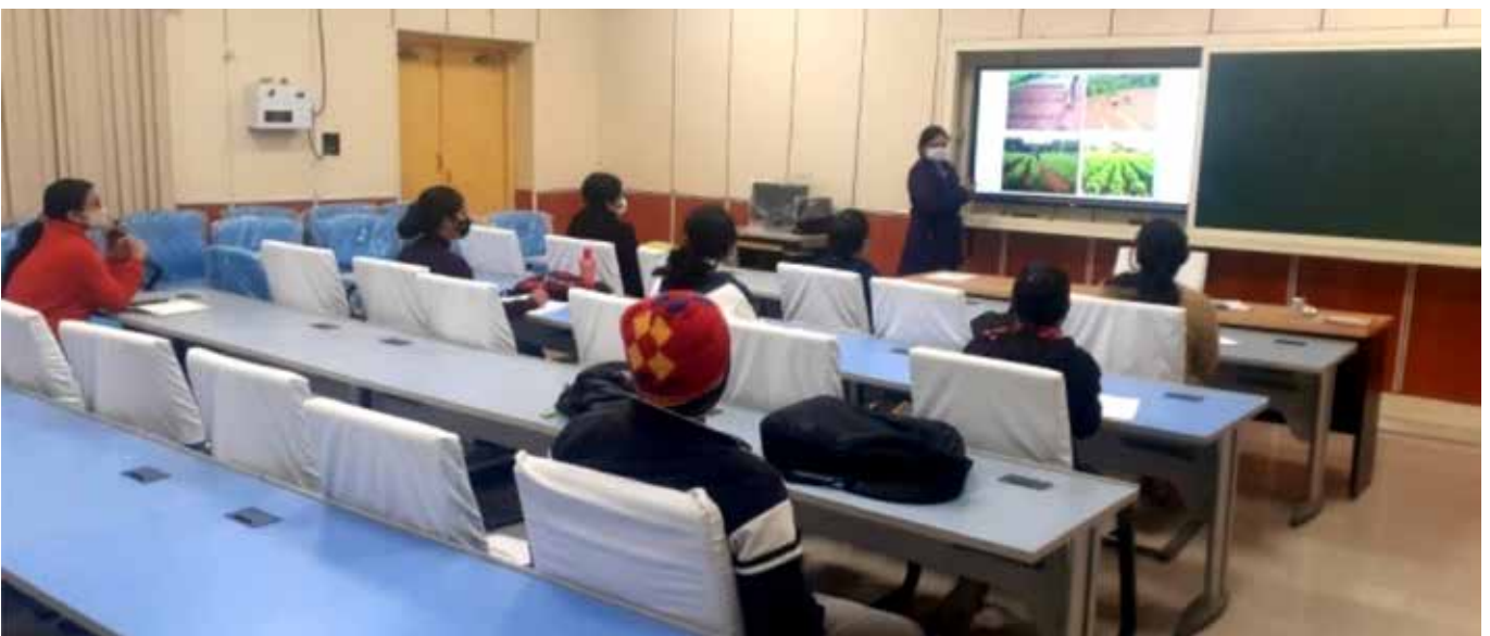
PhD class in Smart class room