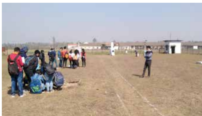
Hands-on training of meteorological instruments at Agrometeorological Observatory, NEB CRC, Pantnagar