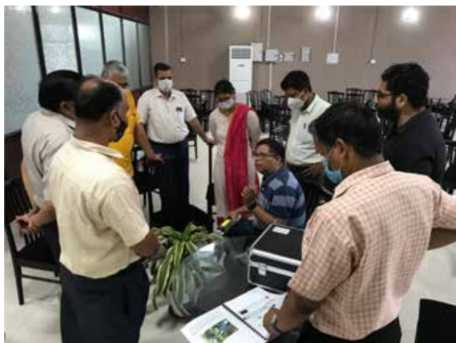
Hands-on training and demonstration of Photosystem on 8 th September, 2021 under Agri-Informatics group, IDP, NAHEP