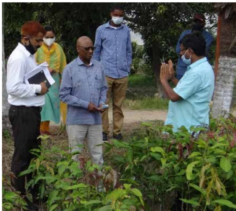
Visit of government officer Guinea to HRC, Patharchatta