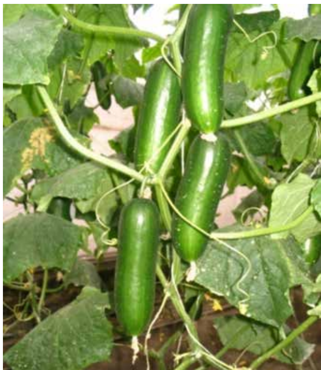
Pant Parthenocarpic Cucumber-3