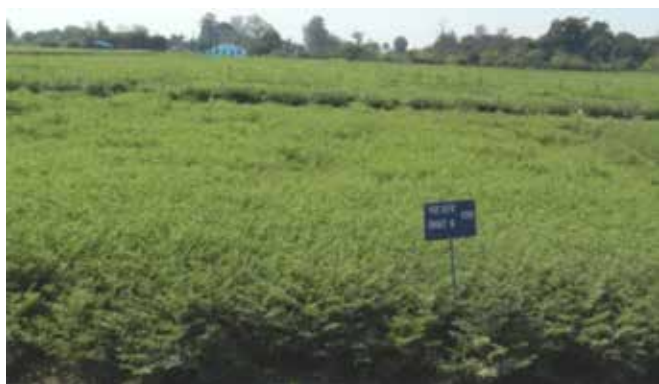
Pant Chana - 9