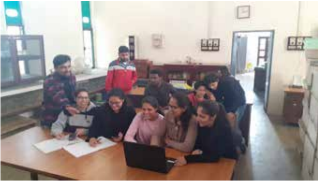
Student conducting “National Entomology Quiz-202”