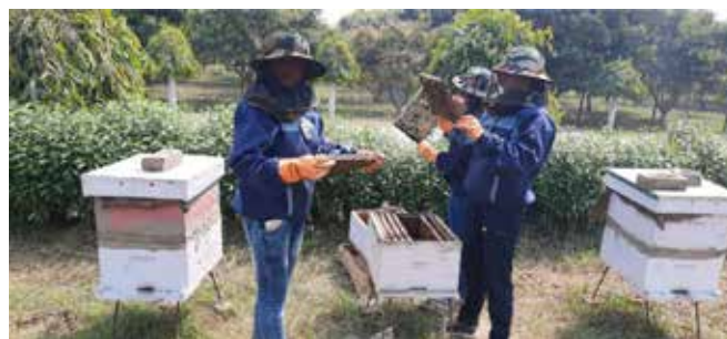
B.Sc. Ag. Final year students doing beekeeping activities under ELP course APE 451 Commercial Beekeeping