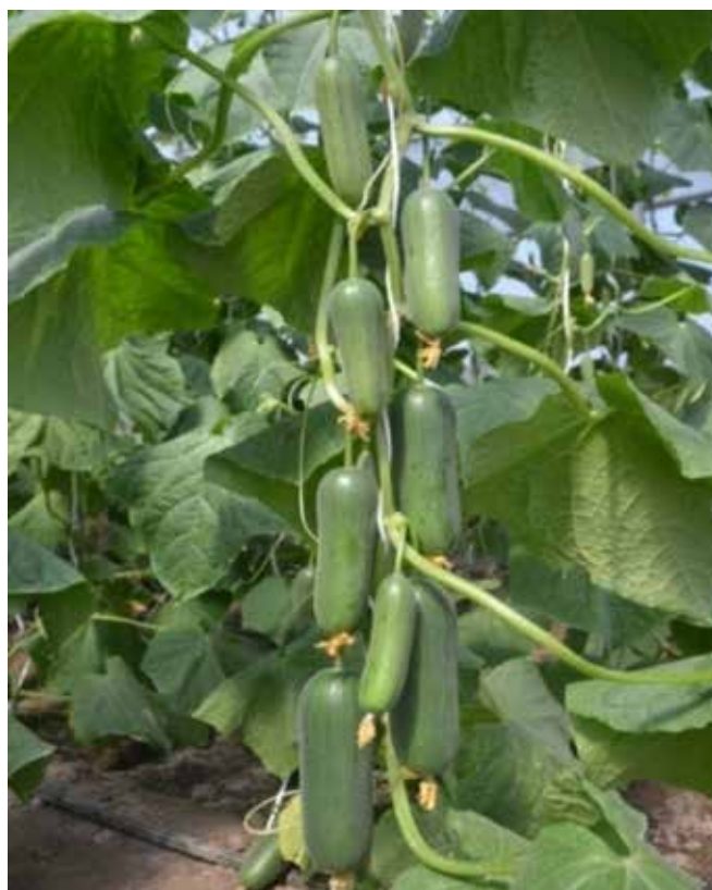
Pant Parthenocarpic Cucumber-2