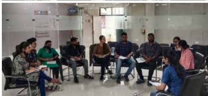
Group discussion conducted with college student by corporate firms