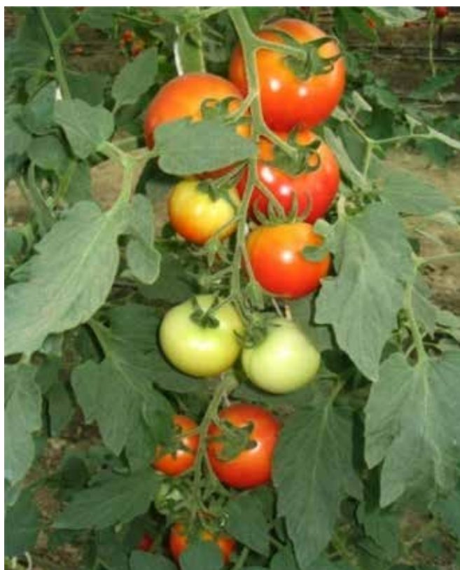
Pant Polyhouse Hybrid Tomato-1