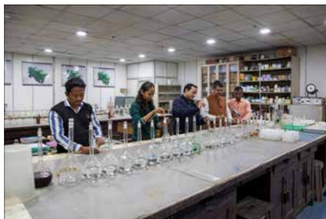
Students working in Micronutrient Laboratory in the Department of Soil Science