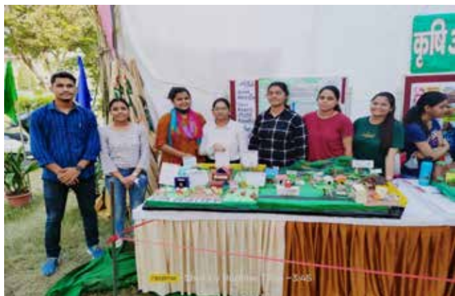
PG students at Departmental stall during Kisan Mela