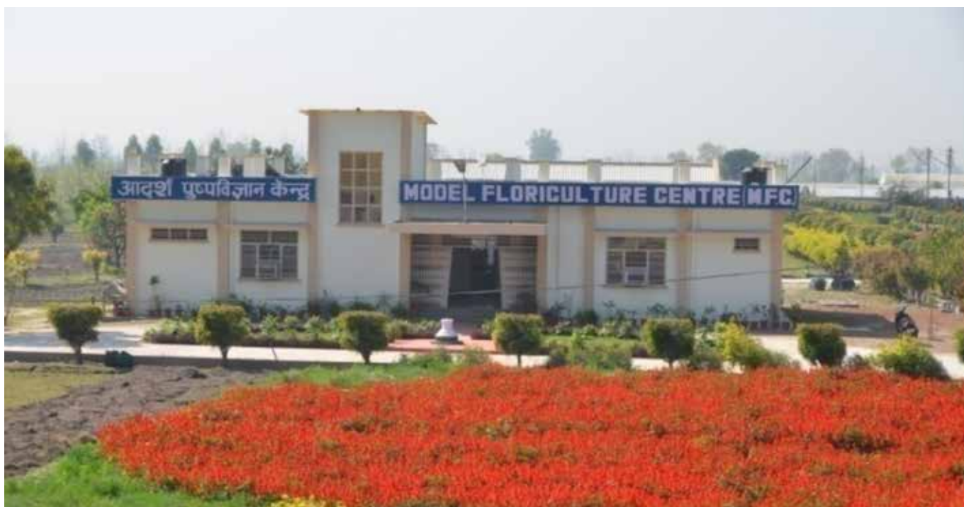
Blooming beautiful flowers at Model Flouriculture Centers