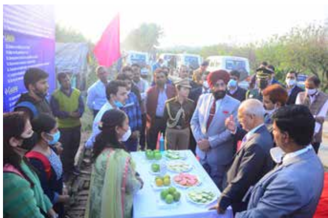
Visit of Hon'ble Governor of Uttarakhand and Chancellor, Lt. Gen. Gurmit Singh to HRC, Patharchatta