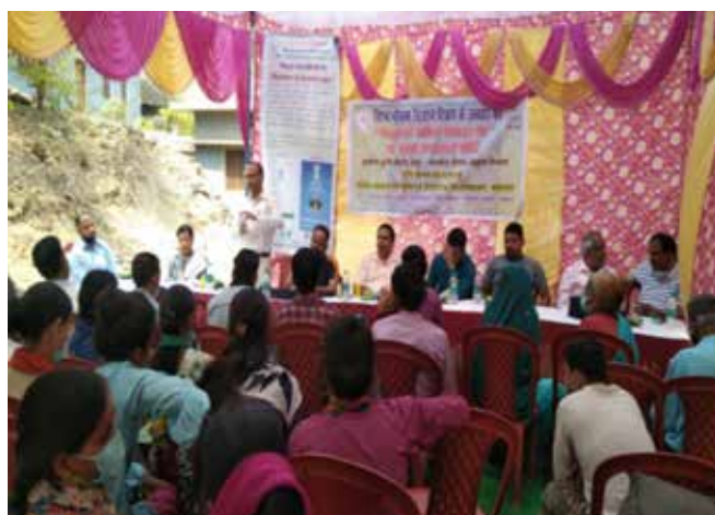
Farmers' Awareness Programme (FAP) on "Meghdoot and Damini Mobile App" organized on 23 rd March, 2021