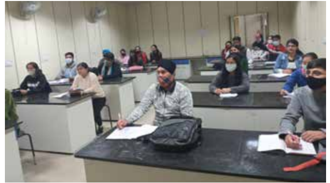
PG class in Morphology laboratory