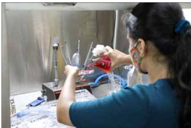
Students working in Microbiology Laboratory in the Department of Soil Science