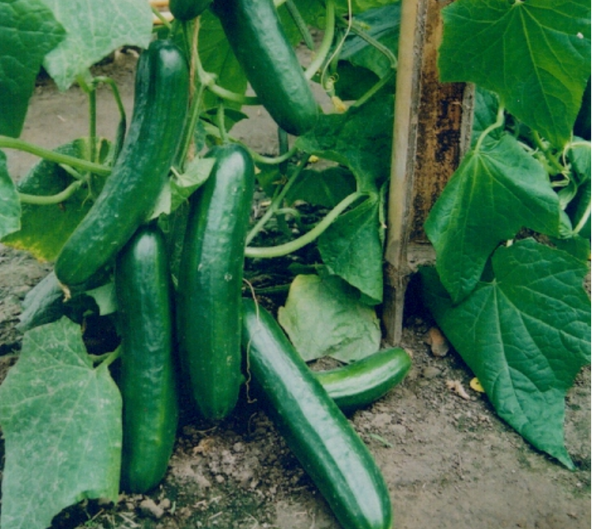
Pant Parthenocarpic Cucumber-3

Cucumber-2 These varieties have been recommended by All India Coordinated Research Project on Vegetable crops workshop held at ICAR-Indian Institute